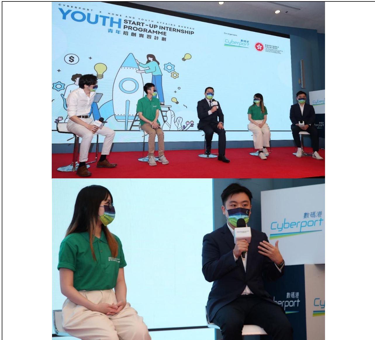
Photo 1: Participating start-ups and interns shared how they benefitted from the Youth Start-up Internship Programme.