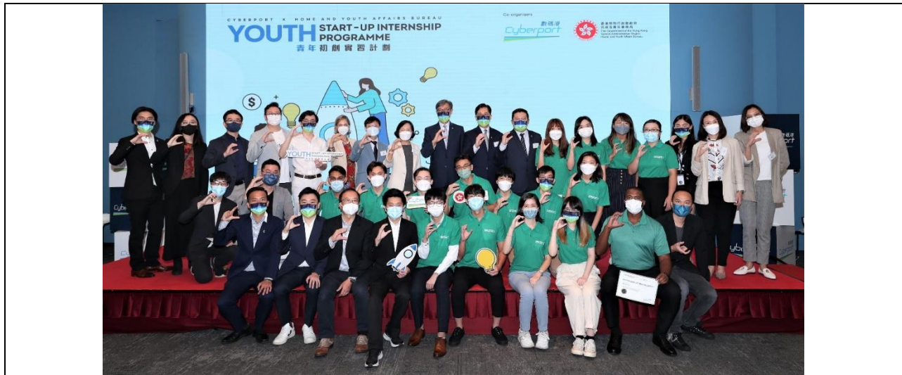
The Youth Start-Up Internship Programme, launched in collaboration between Cyberport and the Home and Youth Affairs Bureau, successfully concluded with over 4,900 job applications.

For high-resolution photos, please download via this link .