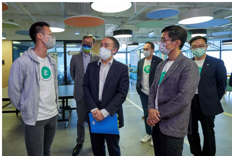
Mr Christopher Hui, Secretary for Financial Services and the Treasury, listens to the representatives of the ZA Bank introducing the company's services.