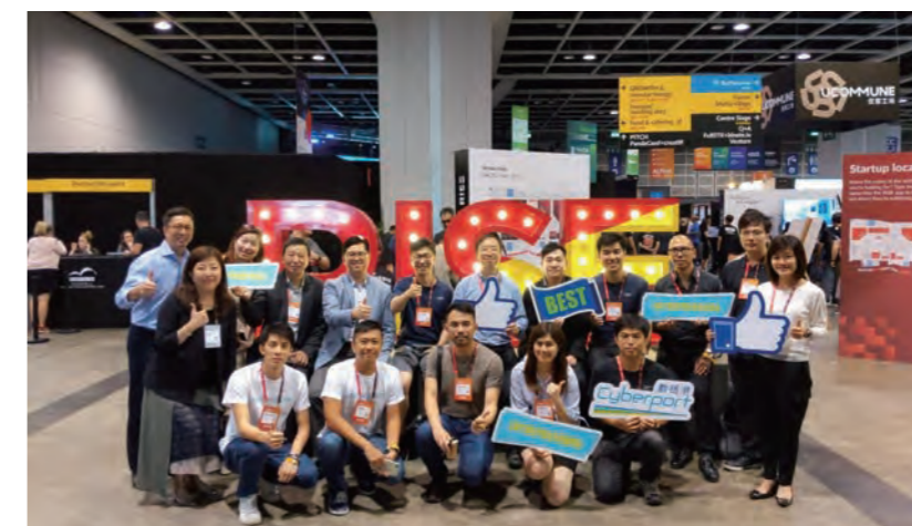
Cyberport participated in RISE Conference in July last year, introducing Cyberport start-ups to attendees around the world 數碼港在去年7月參與了「RISE會議」，向世界各地的參加者介紹園區的初創企業