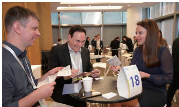
Cyberport actively expands its global network of partners and investors to support the development of start-ups 數碼港積極拓展全球合作夥伴和投資者網絡，以支援初創企業發展