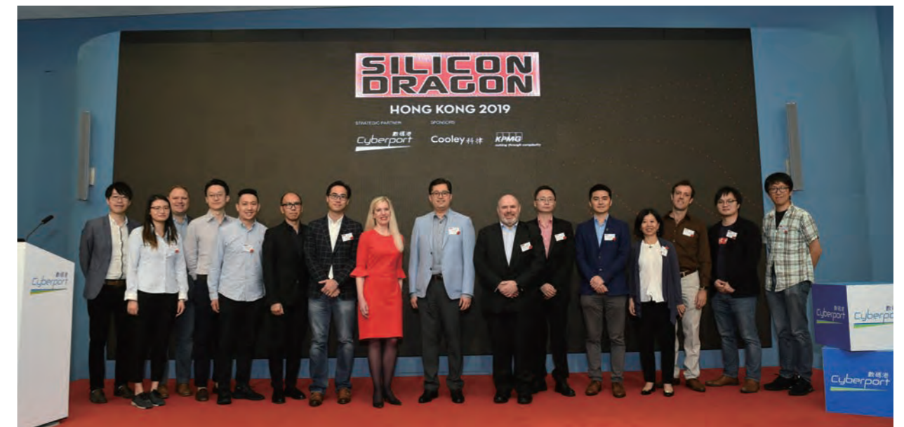
Start-ups exchanged ideas with successful entrepreneurs, venture capitalists and industry experts through participating in Silicon Dragon 初創企業通過參與Silicon Dragon，與成功企業家、風險投資者及業界領袖交流

繼往開來，數碼港的國際網絡將扮演重要角色，協助初創企業與全球潛在投資者接觸及開拓國際市場。展望未來，我們期望能吸引更多科技企業和海外人才加入數碼港社群，進一步振興本地創新科技生態系統發展，提昇我們在新常態下的競爭力。