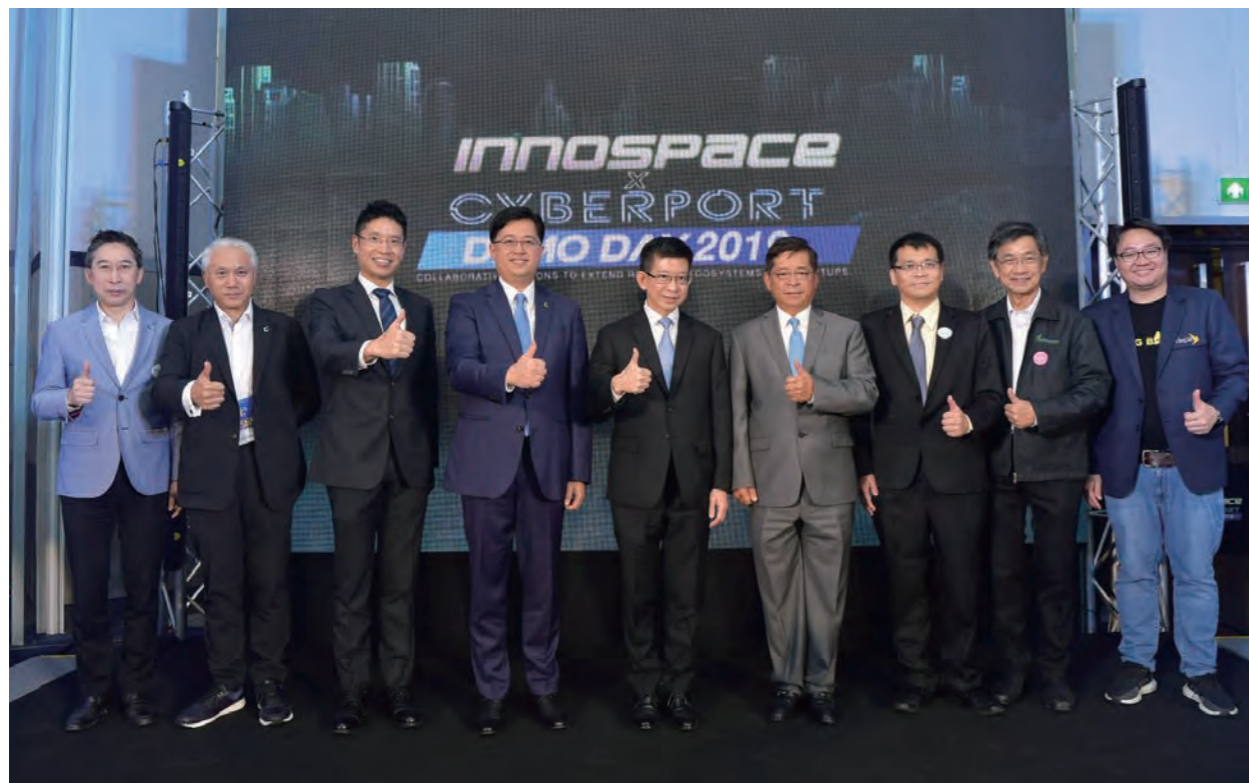
Cyberport start-ups pitched to Thailand and ASEAN corporations and investors on The Innospace Cyberport Demo Day in Innospace Cyberport Demo Day, 數碼港初創企業向泰國和東盟的公司及投資者演示其方案

As we move forward, Cyberport's international networks will play a crucial role in helping start-ups gain exposure to potential investors and expansion opportunities all over the world. We look forward to engaging more technology enterprises and overseas talent to join the Cyberport community, further invigorating the local I&T ecosystem, and enhancing our competitiveness for the 'new normal'.