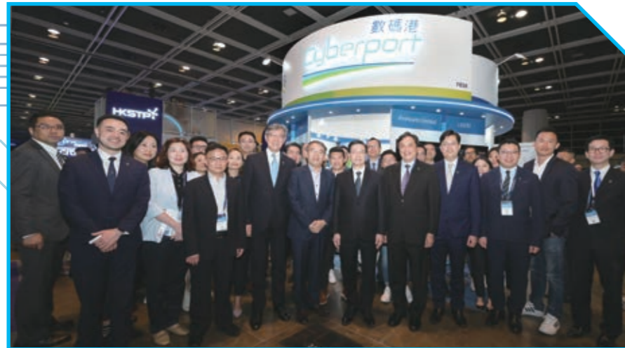
John Lee, Chief Executive of the HKSAR Government, visited the Cyberport booth at the Hong Kong FinTech Week and interacted with Cyberport start-up teams and management. 香港特區政府行政長官李家超到訪數碼港於香港金融科技周展位，並與數碼港一眾初創及管理層交流。

To solidify Hong Kong's international financial centre status, we supported the HKMA's Project Ensemble to promote asset tokenisation and wholesale Central Bank Digital Currency (CBDC). We also co-hosted the Hong Kong Green FinTech Summit to propel Hong Kong's GreenTech and Green Finance aspirations further.