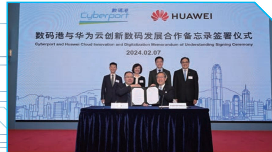
Cyberport signed a Memorandum of Understanding with Huawei Cloud to develop a collaborative framework for industry cloud innovation and technology industry chain to promote digitisation and facilitate the I&T ecosystem in Hong Kong. 數碼港與華為雲簽署合作備忘錄，為推動產業雲創新和促進科技產業鏈發展協作定下框架，共同推動香港創科生態圈發展及數字化。

數碼港深知人工智能及網絡基建的重要作用，率先推出具影響力的措施。我們透過與 百度 簽署合作備忘錄，率先在香港籌辦人工智能產業賦能中心，同時與 華為雲 建立合作關係，為香港的人工智能及數碼生態系統注入新動力。我們與 思科 簽署合作備忘錄，共同加強香港在人工智能、網絡安全及未來網絡方面的實力。同時，我們與 華潤研究院 推出聯合加速器計劃，並與 Brinc 組成策略聯盟。