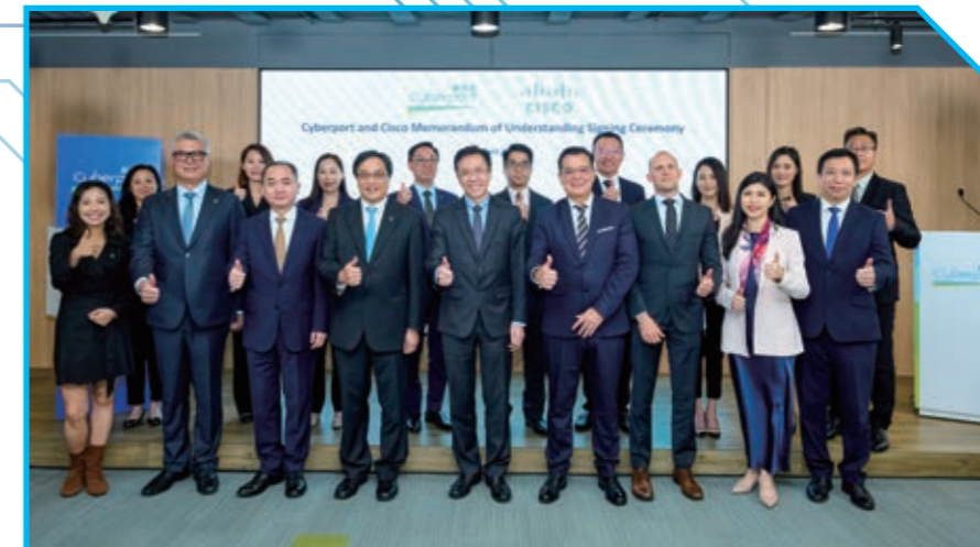
Cyberport entered into a Memorandum of Understanding with CISCO to advance technologies such as AI, future-ready network, and cybersecurity, paving the way to drive innovations. 數碼港和思科簽署合作備忘錄，攜手提升先進技術，包括人工智能、未來網絡及網絡安全，驅動革命性創新。