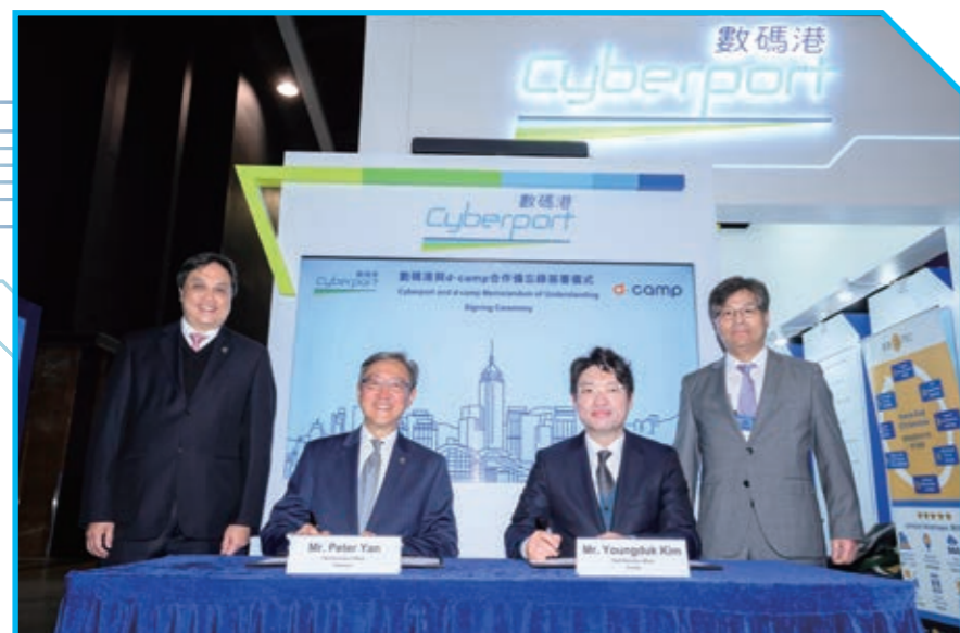
Cyberport signed a Memorandum of Understanding with Korean Start-up Hub d·camp at Asian Financial Forum, to strengthen I&T exchange between Hong Kong and Korea and nurture start-ups from both places to shine. 數碼港於亞洲金融論壇與韓國創科中心d·camp簽署合作備忘錄，強化香港及韓國的創科交流，共同培育兩地初創企業成長。

數碼港著眼全球，積極發展對外業務，意在鞏固香港的國際創科中心地位。我們與沙特阿拉伯領先的國家實驗室阿卜杜勒阿齊茲國王科技城( KACST )簽署了促進跨境合作的合作備忘錄，而我們與韓國 d·Camp 簽署的合作備忘錄則為深化與韓國初創企業的創新及合作鋪平了道路，進一步豐富了我們的國際網絡。