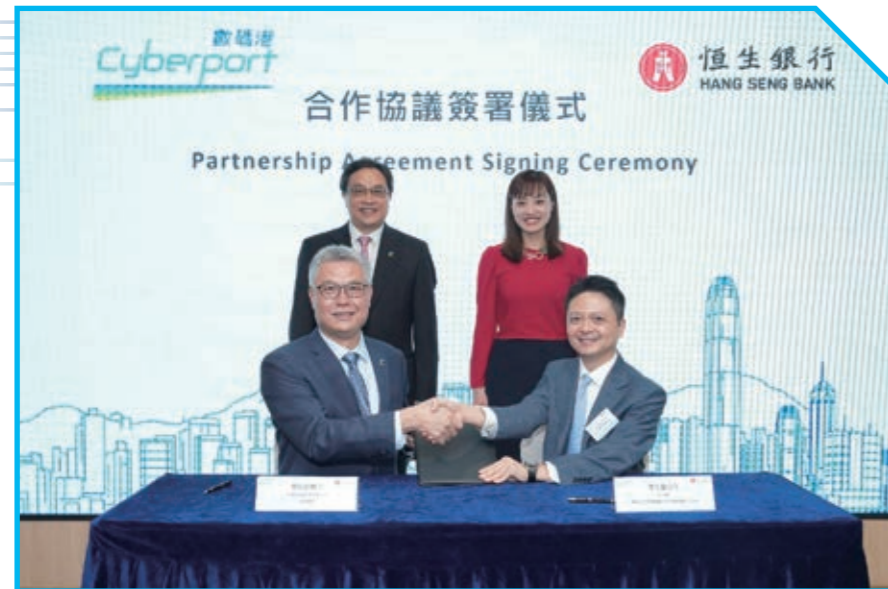
Cyberport and Hang Seng Bank have expanded the partnership established through the Memorandum of Understanding in 2021. This expanded collaboration focuses on the Index Innovation Lab, SME digital transformation, green finance and technology, and nurturing I&T talents. The renewed partnership aims to facilitate the development of I&T in Hong Kong. 數碼港與恒生銀行擴大2021年合作備忘錄的合作範疇，聚焦指數創新實驗室、中小企數碼轉型、綠色金融與科技以及創科人才培育，旨在推動香港整體創科科技的發展。

我們歡迎超過30名成員加入「 數碼港投資者網絡 」，目前投資者總數逾200名，其中包括全球各地的創投公司、家族投資辦公室、私募基金公司及企業創投公司。該批投資者對於優質科技企業有著共同偏好，並致力增強數碼港初創企業的集資及促成交易能力。截至2024年9月，該網絡已累計向數碼港社群企業投資25.97億港元（3.33億美元）。隨著Web3.0激起投資者的興趣，我們推出「 Web3.0投資圈 」，為Web3.0領域創建了專屬的投資者網絡，並為該領域的初創企業建立可靠的融資渠道。