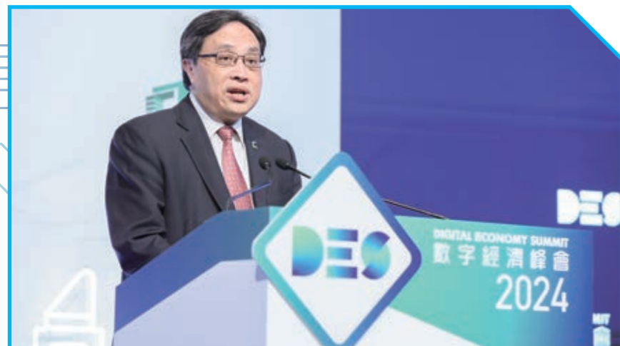
The Digital Economy Summit 2024 showcased a visionary hub of future technovation, forging a sustainable future together. 2024數字經濟峰會展示前瞻性未來創新樞紐，共創可持續未來。

Cyberport's Digital Economy Summit (DES) 2024 , jointly organised with the HKSAR government, made a resounding return, invigorating and propelling Hong Kong's smart city development. The summit drew more than 4,000 in-person and virtual participants from 40 countries and regions and featured over 100 speakers from Mainland China, the United States, Germany, the Middle East, ASEAN, the Asia-Pacific region, and Hong Kong. Industry luminaries and business leaders provided invaluable insights on "Smarter Technovation for All: Forging a Sustainable Future", underscoring how smart city initiatives enhance the quality of urban life and create a sustainable environment.