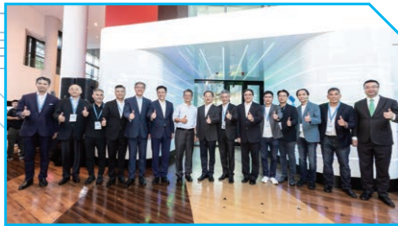
Paul Chan Mo-po, Financial Secretary of the HKSAR Government, officiated the opening ceremony of the Web3 Living Lab. 香港特區政府財政司司長陳茂波主持Web3 Living Lab (Web3生活體驗館) 開幕禮。

另一項旗艦活動「 2023數碼娛樂領袖論壇 」，重點關注Web3.0和區塊鏈技術在數碼港關鍵集群數碼娛樂中的變革潛力。該活動以「娛樂Power UP! Web3新視界」為主題，吸引現場和線上逾3,500人參加，參加人數突破紀錄，並有90名講者齊聚一堂，剖析數碼娛樂在Web3.0時代下的格局演變，分享數碼娛樂如何為藝術、教育、運動和生活等領域帶來全新體驗。作為數碼港成立二十周年紀念活動和特區政府「開心香港」活動的一部分，2023數碼娛樂領袖論壇亦見證了財政司司長為數碼港Web3 Living Lab (Web3生活體驗館) 揭幕。該專用平台構成推廣Web3.0、促進業務創新、鼓勵實驗和促進知識交流的基石。