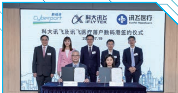
iFLYTEK Co., Ltd., a leading listed company specialising in AI, along with its subsidiary Xunfei Healthcare Technology Co., Ltd., signed a landing agreement with Cyberport. The iFLYTEK group will establish its international headquarters at Cyberport. 人工智能上市企業科大訊飛股份有限公司及旗下子公司訊飛醫療科技股份有限公司與數碼港簽署入駐園區協議，科大訊飛集團將落戶數碼港及成立國際總部。

Cyberport's Web3.0 community has become a powerhouse with over 270 companies, forming the largest Web3.0 community in Hong Kong. The Web3 Hub@Cyberport initiative attracted Web3.0 companies to the city, from Mainland China and 19 other countries. We welcomed around 130 Web3.0 companies into the Cyberport Incubation Programme and launched the Web3.0 Internship Programme 2024 , drawing local, Mainland, and overseas university students to intern at Hong Kong's Web3.0 companies. In 2024, we partnered with Draper University in Silicon Valley to incorporate Web3.0 elements for the first time in the Cyberport University Partnership Programme , empowering students to pursue Web3.0 aspirations. The newly established Web3 Academy provides training and seminars to over 3,500 participants, including founders, developers, entrepreneurs, companies, and university students. To accelerate industry development, we organised and supported over 30 Web3.0 events since May 2023 and launched the Web3 Proof-of-Concept Subsidy Scheme , awarding HK$150,000 grants to 45 projects. The Web3 Living Lab has attracted over 7,600 visitors since its launch.