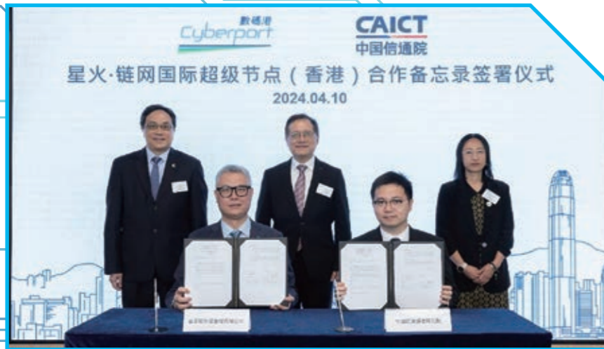
Cyberport signed a Memorandum of Understanding with the China Academy of Information and Communications Technology (CAICT) to collaborate on the establishment of the ASTRON Supernode (Hong Kong) and to promote the advancement of digital infrastructure in the city. 數碼港與中國信息通信研究院（「中國信通院」）就合作推動在香港建設「星火·鏈網」國際超級節點（香港）簽署合作備忘錄，攜手促進香港數字基礎設施建設。