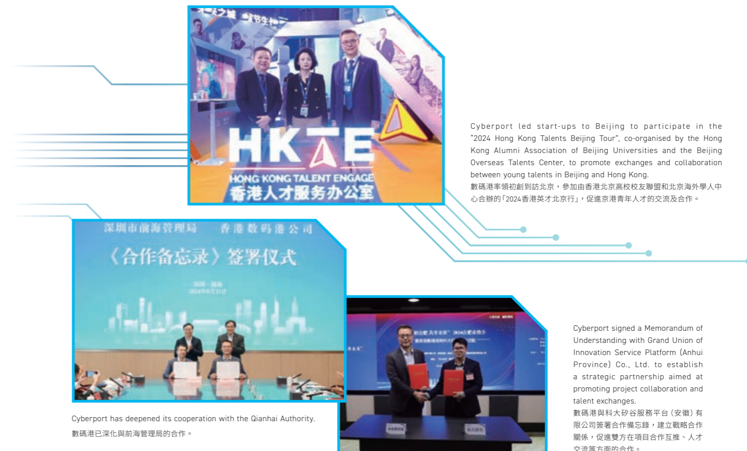
Cyberport led start-ups to Beijing to participate in the "2024 Hong Kong Talents Beijing Tour", co-organised by the Hong Kong Alumni Association of Beijing Universities and the Beijing Overseas Talents Center, to promote exchanges and collaboration between young talents in Beijing and Hong Kong. 數碼港率領初創到北京，參加由香港北京高校校友聯盟和北京海外學人中心合辦的「2024香港英才北京行」，促進京港青年人才的交流及合作。

數碼港亦繼續強化內地夥伴網絡，包括深化與前海管理局的合作，並已與中國信息通信研究院、華為、百度、螞蟻集團、北京中關村、北京國際大數據交易所、科大矽谷服務平台(安徽)有限公司、香港北京高校校友聯盟、杭州市上城區人民政府等建立合作夥伴關係，為吸引更多內地企業落戶香港奠定基礎。