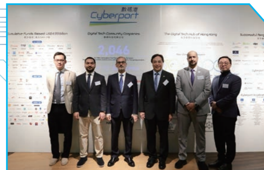
The Ambassador of the United Arab Emirates in Beijing, H.E. Hussain bin Ibrahim Al Hammadi, led a delegation to visit Cyberport to learn about the local I&T ecosystem. 阿聯酋駐華大使H.E. Hussain bin Ibrahim Al Hammadi率領代表團到訪數碼港，認識本地創科生態圈發展。

香港方面，我們接待了來自大灣區、海內外總領事、高管、協會、企業集團和政府部門的246次來訪。我們歡迎英國商業及貿易部國務大臣及代表團，以及阿聯酋經濟部長所率領的代表團來港訪問，同時亦有接待內地代表團，包括廣東省工業和信息化廳、廣東省發展和改革委員會、廣東省粵港澳大灣區辦公室、深圳市前海管理局、深圳市青年聯合會、中山市副市長及中山市科學技術局、山東省科技廳及北京市青年聯合會。在訪問期間，我們向來賓介紹數碼港並交流見解，同時為160名社群成員提供寶貴的接觸和參與機會，幫助他們在生態圈內建立聯繫。