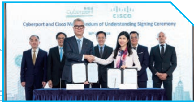
Cyberport signed a Memorandum of Understanding with Cisco to collaborate on enhancing AI capabilities in Hong Kong. 數碼港與思科簽署合作備忘錄，攜手提升香港人工智能實力。

隨著數碼港 人工智能超算中心 將於2024年底投入營運，香港人工智能產業將迎來加速發展，同時政府已撥款30億元支援本地大學、研發中心及人工智能相關企業等利用人工智能超算中心的算力，從而大幅提升香港在健康科技、數據科學、先進製造與新能源科技等方面的研發能力。人工智能超算中心亦將為生成式人工智能及大型語言模型構建等尖端技術奠定堅實基礎。同時，數碼港致力打造綜合生態系統，涵蓋算力基礎設施、基礎／垂直／專業大型模型開發等，並引入系統集成商。目前，數碼港匯聚逾300間專注人工智能、大數據及機械人技術領域的初創企業，並於近期與科大訊飛、思科、百度、華為及壁切科技等領軍企業簽署合作協議，以全面打造人工智能技術及產業發展生態系統。