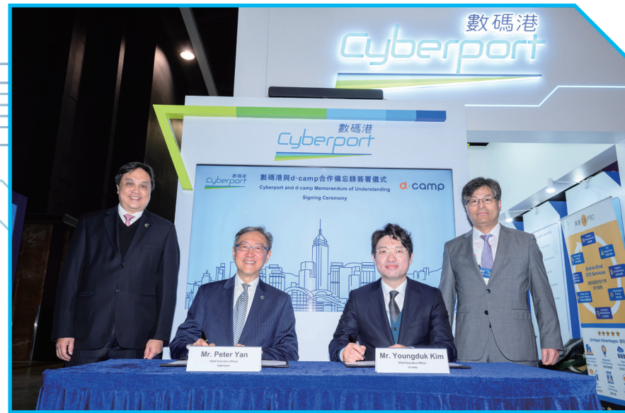
Cyberport signed a Memorandum of Understanding with Korean Start-up Hub d-camp at Asian Financial Forum, to strengthen I&T exchange between Hong Kong and Korea and co-nurture start-ups from both places to shine. 数码港于亚洲金融论坛与韩国创科中心d-camp签署合作备忘录，强化香港及韩国的创科交流，共同培育两地初创企业成长。

数码港着眼全球，积极发展对外业务，意在巩固香港的国际创科中心地位。我们与沙特阿拉伯领先的 国家实验室阿卜杜勒阿齐兹国王科技城(KACST) 签署了促进跨境合作的合作备忘录，而我们与韩国 d-Camp 签署的合作备忘录则为深化与韩国初创企业的创新及合作铺平了道路，进一步丰富了我们的国际网络。