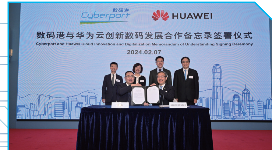
Cyberport signed a Memorandum of Understanding with Huawei Cloud to develop a collaborative framework for industry cloud innovation and technology industry chain to promote digitisation and facilitate the I&T ecosystem in Hong Kong. 数码港与华为云签署合作备忘录，为推动产业云创新和促进科技产业链发展协定下框架，共同推动香港科创生态圈发展及数字化。

数码港深知人工智能及网络基建的重要作用，率先推出具影响力的措施。我们透过与 百度 签署合作备忘录，率先在香港筹办人工智能产业赋能中心，同时与 华为云 建立合作关系，为香港的人工智能及数码生态系统注入新动力。我们与 思科 签署合作备忘录，共同加强香港在人工智能、网络安全及未来网络方面的实力。同时，我们与 华润研究院 推出联合加速器计划，并与Brinc组成策略联盟。