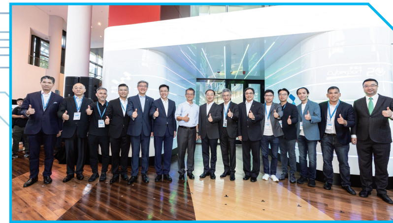
Paul Chan Mo-po, Financial Secretary of the HKSAR Government, officiated the opening ceremony of the Web3 Living Lab. 香港特区政府财政司司长陈茂波主持Web3 Living Lab (Web3生活体验馆)开幕礼。

另一项旗舰活动 "2023数码娱乐领袖论坛" ，重点关注Web3.0和区块链技术在数码港关键集群数码娱乐中的变革潜力。该活动以"娱乐Power UP! Web3新视界"为主题，吸引现场和线上逾3,500人参加，参加人数突破纪录，并有90名讲者齐聚一堂，剖析数码娱乐在Web3.0时代下的格局演变，分享数码娱乐如何为艺术、教育、运动和生活等领域带来全新体验。作为数码港成立二十周年纪念活动和特区政府"开心香港"活动的一部分，2023数码娱乐领袖论坛亦见证了财政司司长为数码港Web3 Living Lab (Web3生活体验馆)揭幕。该专用平台构成推广Web3.0、促进业务创新、鼓励实验和促进知识交流的基石。