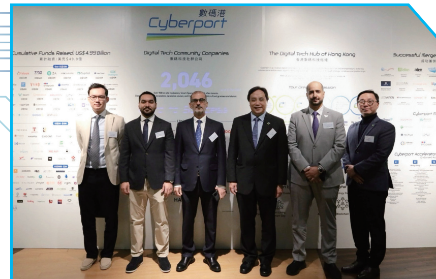
The Ambassador of the United Arab Emirates in Beijing, H.E. Hussain bin Ibrahim Al Hammadi, led a delegation to visit Cyberport to learn about the local I&T ecosystem. 阿联酋驻华大使H.E. Hussain bin Ibrahim Al Hammadi率领代表团到访数码港，认识本地创科生态圈发展。

香港方面，我们接待了来自大湾区、海内外总领事、高管、协会、企业集团和政府部门的246次来访。我们欢迎英国商业及贸易部国务大臣及代表团，以及阿联酋经济部长所率领的代表团来港访问，同时亦有接待内地代表团，包括广东省工业和信息化厅、广东省发展和改革委员会、广东省粤港澳大湾区办公室、深圳市前海管理局、深圳市青年联合会、中山市副市长及中山市科学技术局、山东省科技厅及北京市青年联合会。在访问期间，我们向来宾介绍数码港并交流见解，同时为160名社群成员提供宝贵的接触和参与机会，帮助他们在生态圈内建立联系。