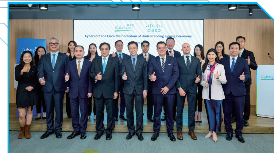
Cyberport entered into a Memorandum of Understanding with CISCO to advance technologies such as AI, future-ready network, and cybersecurity, paving the way to drive innovations. 数码港和思科签署合作备忘录，携手提升先进技术，包括人工智能、未来网络及网络安全，驱动革命性创新。